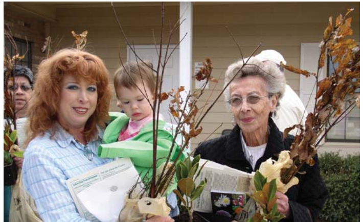
To celebrate Mississippi's Arbor Day, the District gives away free tree seedlings on the second Friday of February each year.